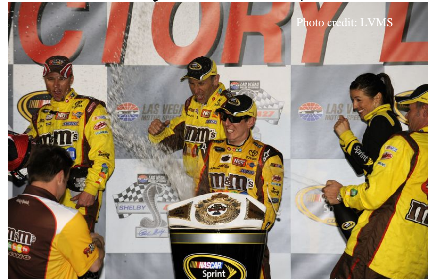
2009 Shelby 427 winner – Kyle Busch